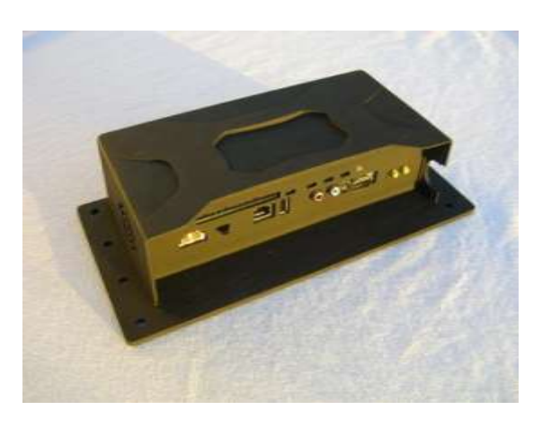
Figure 3. Picture of the main DAS unit which was installed either in sleeper compartment or under passenger-side front seat.

The hard drive is located in the DAS main unit (Figure 3). Rear-facing cameras are located on the side-view mirrors and cellular antenna are installed on the windshield. The cellular capability is critical to controlling the quality of the data, as it both provides "health checks" to VTTI and allows software updates to be broadly deployed to the instrumented vehicles.